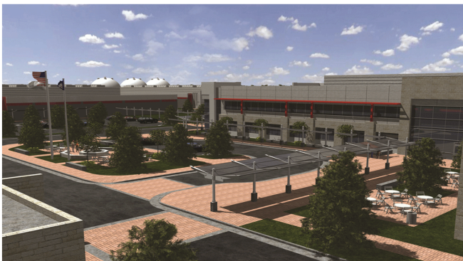
Verizon Terremark Worldwide, Inc.