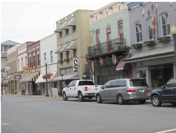
East Davis Street