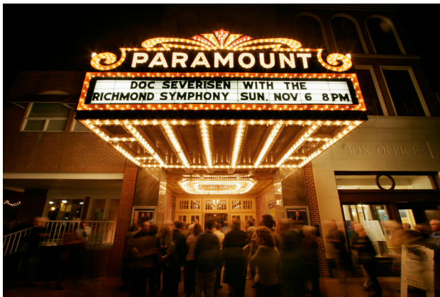
Paramount Theater, located on the historic downtown mall.