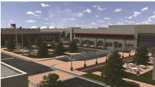
Terremark Worldwide, Inc.