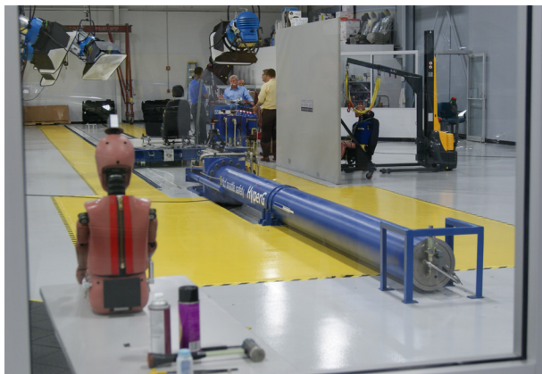
Insurance Institute for Highway Safety