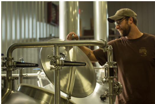
Blue Mountain Brewery opened in 2007 as the first brewery in Nelson County.