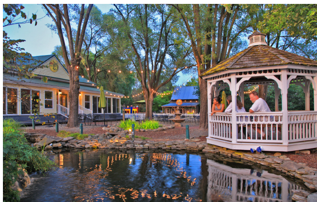
Wild Wolf Brewing Company- howling good beer!

Unemployment Rate 3.7% Labor Force Participation Rate 57.4% Median Age 48.7 Median Household Income $50,994 Average Annual Salary $32,604 Mean Commute Time 30.1 min Percentage of Population with College Experience 52.5%