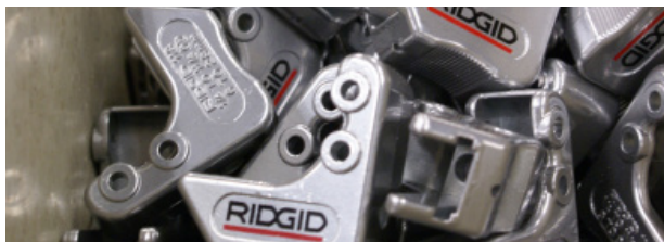
RIDGID, manufacturer of professional quality tools for plumbing, mechanical pipe fitting, construction, HVAC, and facility maintenance.