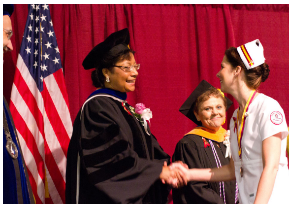
Nursing School graduation at Germanna Community College.