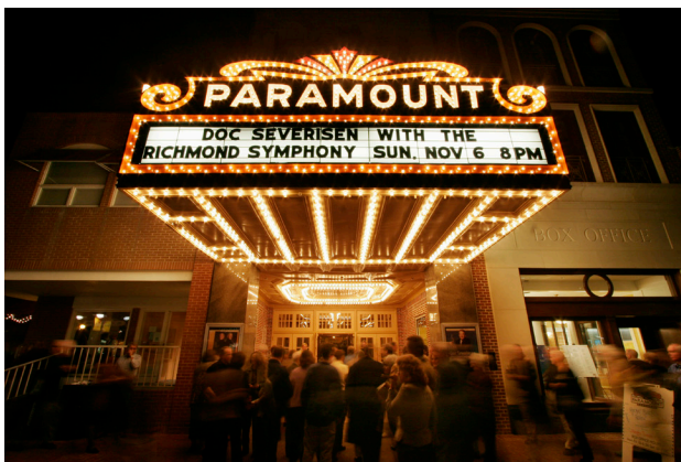
Paramount Theater, located on the historic downtown mall.