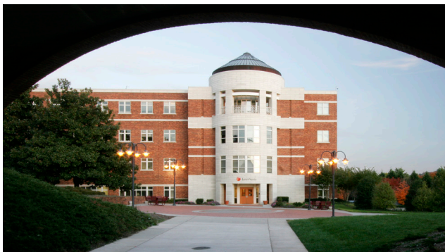
LexisNexis is a leading global provider of content-enabled workflow solutions.