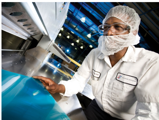
Klöckner-Pentaplast is a leading producer of plastic films for packaging, printing, and specialty applications.