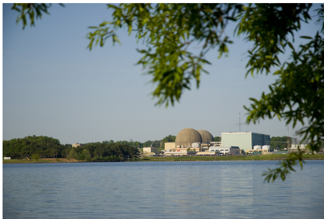
North Anna Power Station - Dominion Power