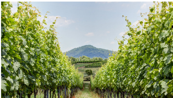
Early Mountain Vineyard, one of Virginia's premier wineries has been named the #1 Place for Weddings by The Knot magazine; and America's #1 Tasting Room by USA Today.