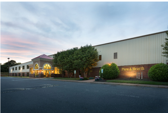
Founded in 1980 as a small country store, Plow & Hearth has grown into a leading retailer of enduring products for home, hearth, yard and garden.