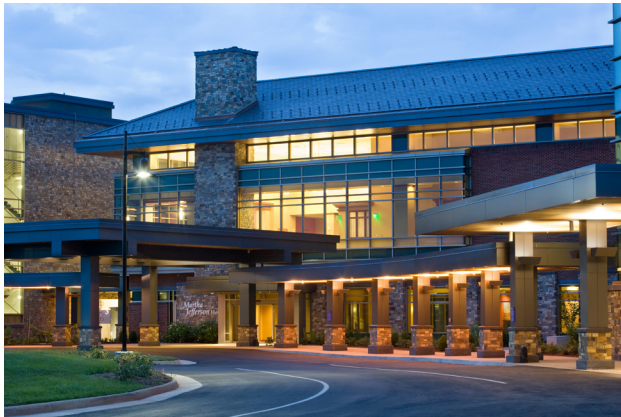
Martha Jefferson Hospital