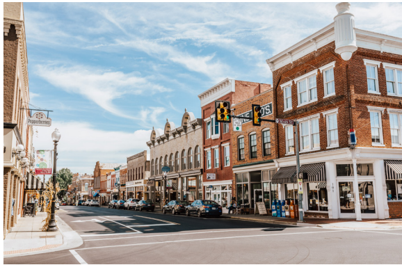
East Davis Street

Unemployment Rate 5.1% Labor Force Participation Rate 64.8% Median Age 39.2 Median Household Income $77,935 Average Annual Salary $46,388 Mean Commute Time 38.2 min Percentage of Population with College Experience 55.6%