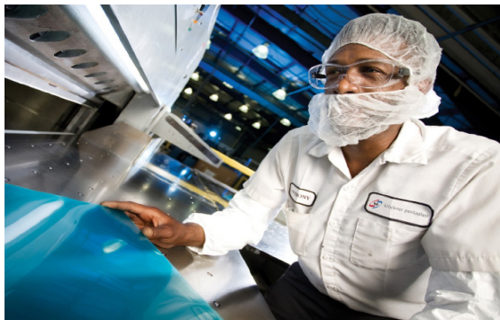
Klößner-Pentaplast is a leading producer of plastic films for packaging, printing, and specialty applications.