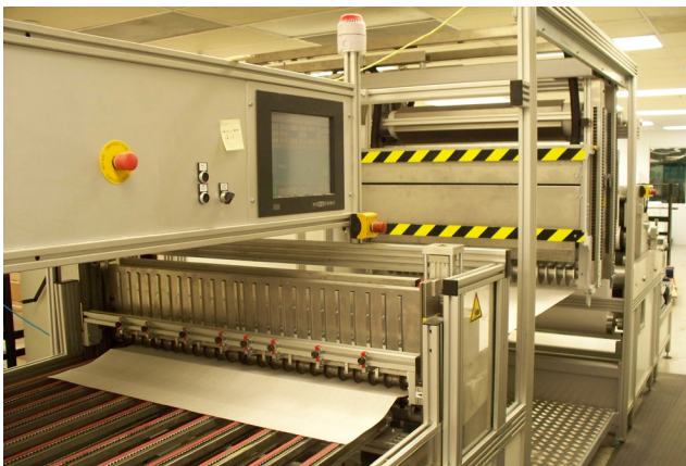
Tri-Dim Filter is a leading manufacturer of commercial/industrial grade air filters