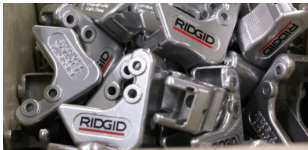
RIDGID, manufacturer of professional quality tools for plumbing, mechanical pipe fitting, construction, HVAC, and facility maintenance.