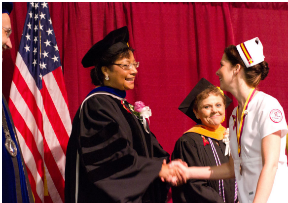
Nursing School graduation at Germanna Community College.