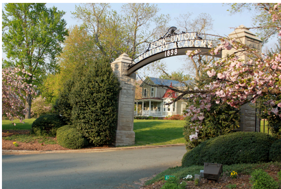
Fork Union Military Academy