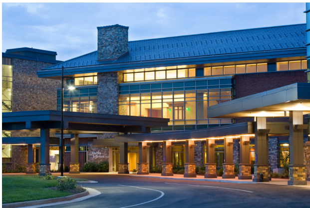
Martha Jefferson Hospital