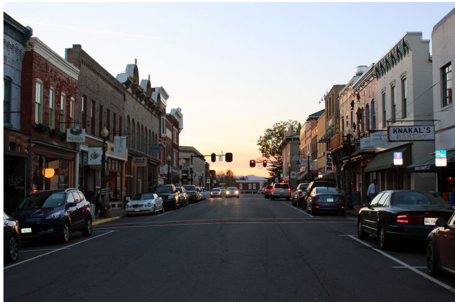
East Davis Street