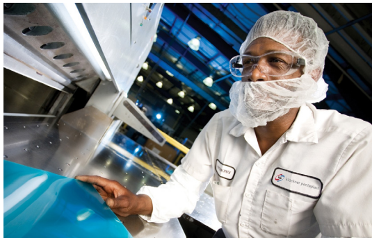
Klößner-Pentaplast is a leading producer of plastic films for packaging, printing, and specialty applications.